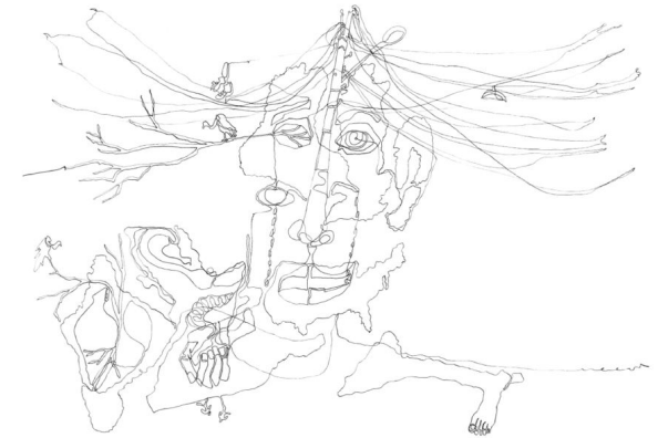
previous winner: Sona Koroghli